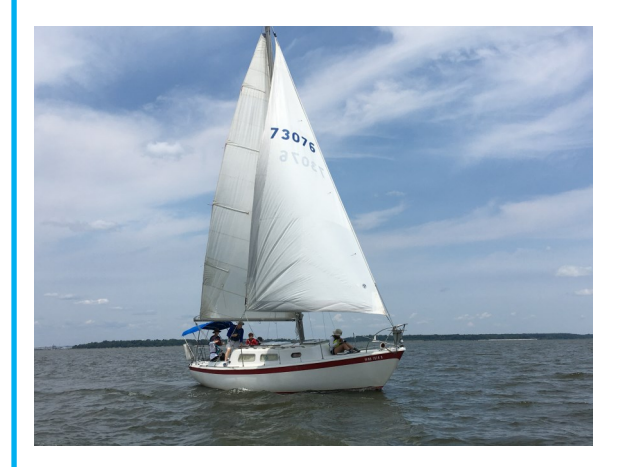
Sea Scout boat Friendly

After 2 days at our West River anchorage, we sailed further north venturing to the 'Maryland Yacht Club' which covers eight acres of beautiful waterfront at the end of Fairview Beach Road in Pasadena, Maryland. It is situated at the entrance to Rock Creek and commands a grand view of the Patapsco River where we ordered a pizza dinner and swam in the Club pool in the late afternoon. From the Yacht Club we crossed the Bay once again and after spending a night at 'Osprey Point Marina,' we Sea Scouts headed back south, passing under the Chesapeake Bay Bridge.