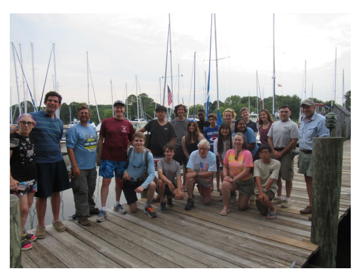
Sea Scout Ship 1942 Long Cruise 2021 Commemorative Group Photo