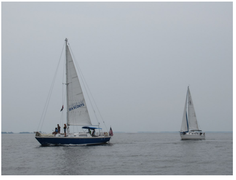
Sea Scout boat AL-DI-LA with Reverent following