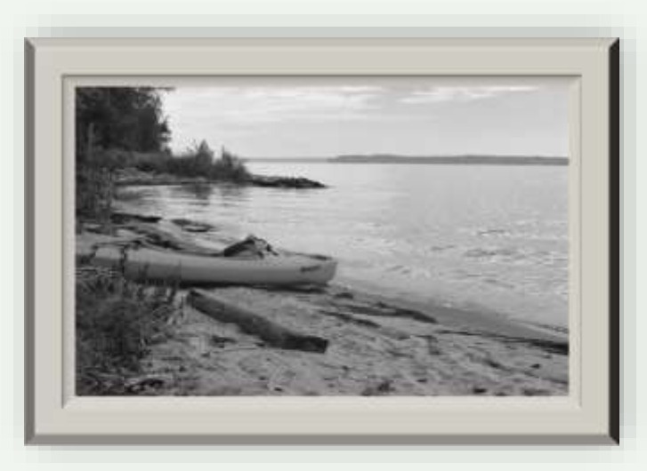
Monarch on the Beach by Lena Sowers

Claire gave instructions on where to put my feet and adjust the feet stoppers, where to place your hands on the paddle so you can feel