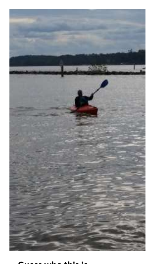
Guess who this is. Hint: A Member-At-Large...