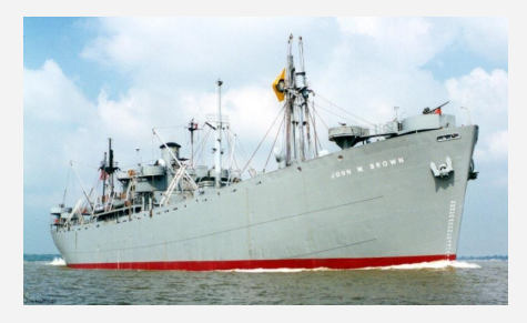
On the Great Lakes in year 2000

General admission for adults and children is $225.00 ($200 for groups of four or more). Lunch is included. check out www.ssjohnwbrown.org, call 410-558-0646 or email john.w.brown@usa.net. S.S. John W. Brown is one of only two operating Liberty Ships. remaining out of 2,710 built nationwide during World War II.