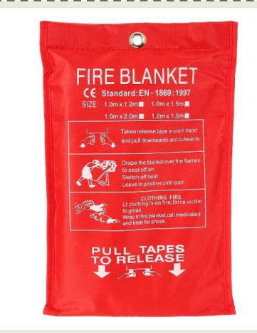
Emergency Fire Blanket by Prepared Hero

Install it on the wall it at least several feet from the stove, so that you can grab it when there is a fire on the stove. Pull the blanket tab out of the holder and drape it over the flames to smother them. These are available from Lowes, Home Depot and other providers like the one linked below that has a demo video.