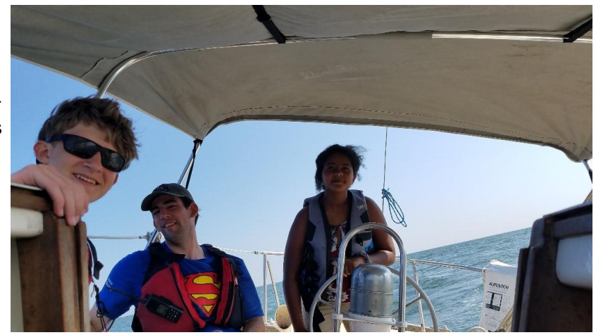
The Sea Scouts cover a third of the bay each year: upper, middle, lower so in the 3rd year, they've covered the "whole" bay! A tall order.

April Meeting Cancelled. Next Planned event is Spring Picnic Check the nvsps.org website for cancellations or with any Bridge Officer.