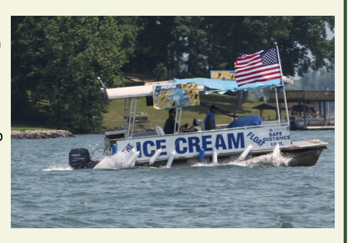
A Welcome Site on Smith Mountain Lake