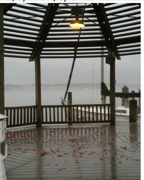
The marina Gazebo looks like a good place for a meeting!