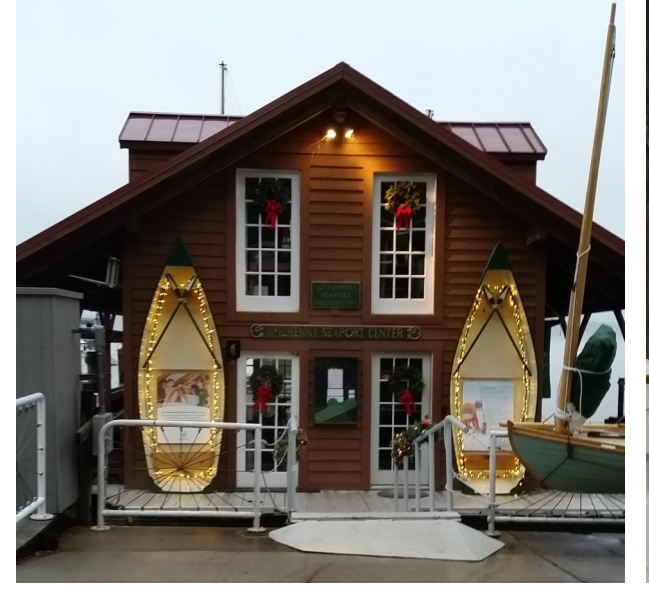
The ASF looked festive and welcoming