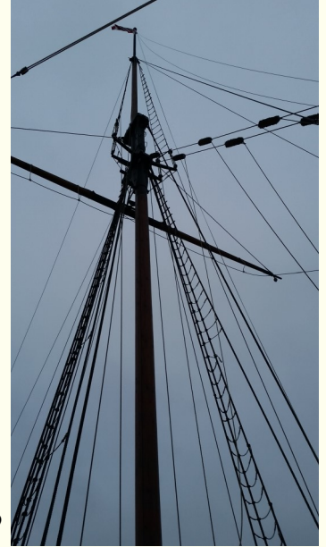
With some spars removed for inspection, a look aloft the Tall Ship Providence

The VA Department of Game and Inland Fisheries has posted a list of bills being considered by the Virginia legislature pertaining to fishing and hunting in the state at <a href="https://www.dgif.virginia.gov/legislation/">https://www.dgif.virginia.gov/legislation/</a>.