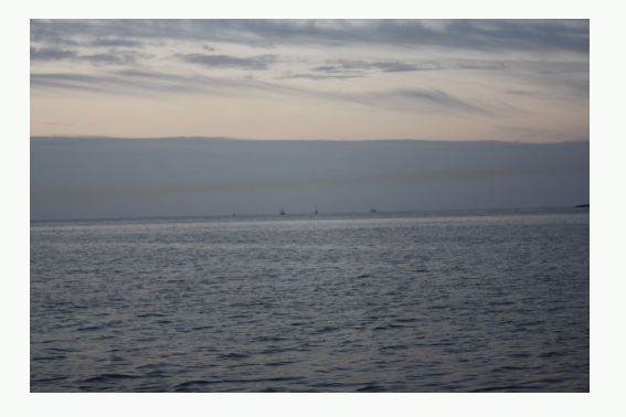
Exiting Little Harbor Cut, crossing NE Providence Channel. Course 175+/- for 45nm to Little Egg Is., Eleuthera. 4 boats ahead of me in the photo, 3 behind me. Everyone receives the same weather forecast.

This is the mooring next to his sailboat LOON . A shark is in the center. To the right is the 3,000 lb. concrete block used to hold the mooring.