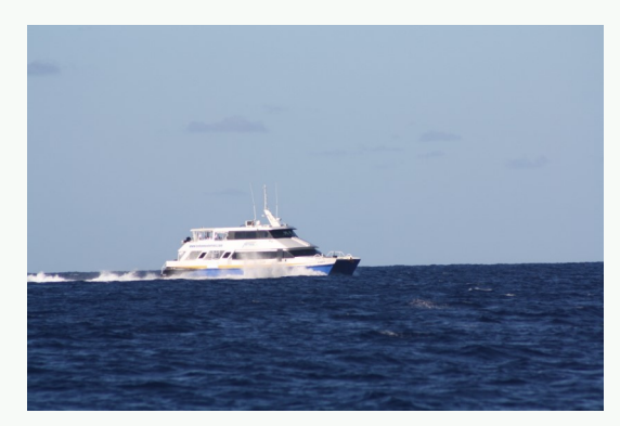
High speed ferry - Nassau to Spanish Wells. Round trip daily, $65 one-way, 2015, don't know current fare.