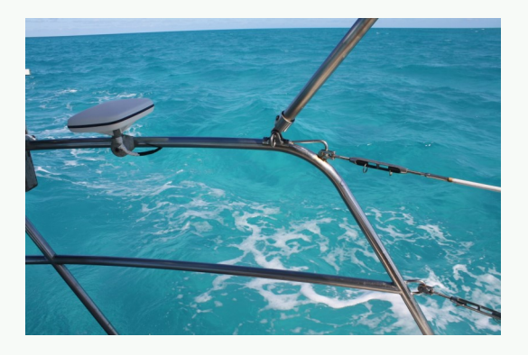
On Exuma bank. water 10' - 18'. camera just cannot capture the pretty waters of the Bahamas.