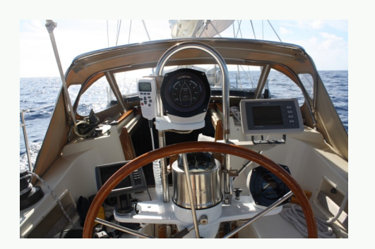
Motoring along. new AIS unit mounted upper right.