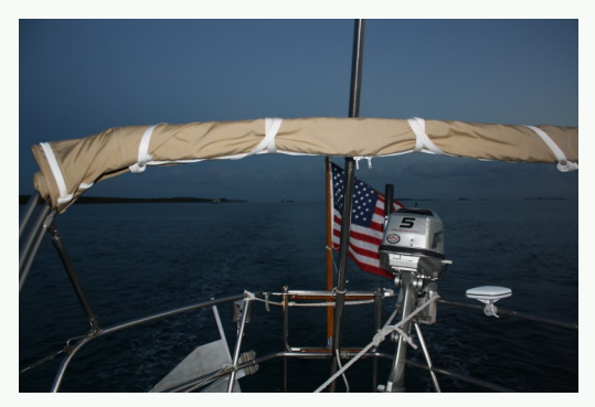
Departing the anchorage before sunrise. Will be a motor sail day, but that is ok.