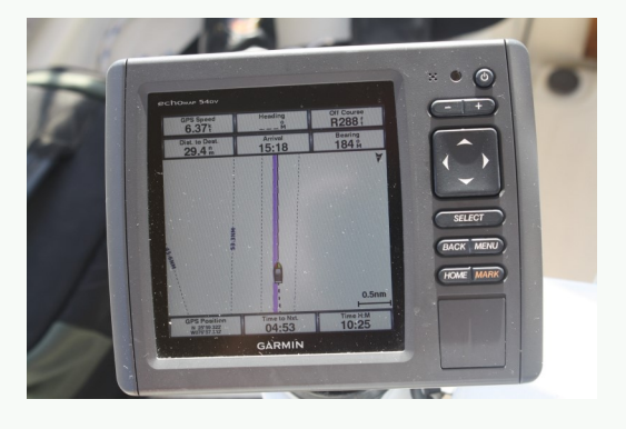
1025 - Chart plotter shows 29.4 nm to way point for Little Egg Is., arrival 1518.