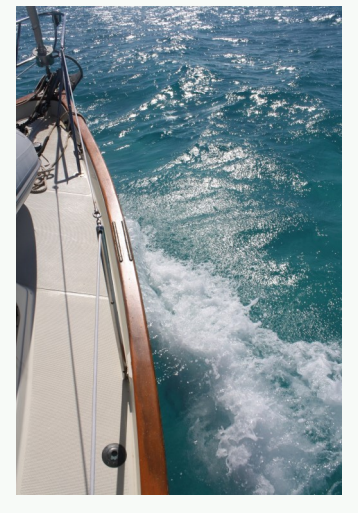
Sunny, 82, pretty water, nice wind - pinch me. Very nice when salt water isn't splashing on deck AND everything else.