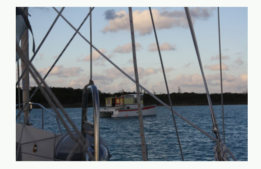
57nm later, anchored Royal Is. Lots of "unique" boats on the waters.