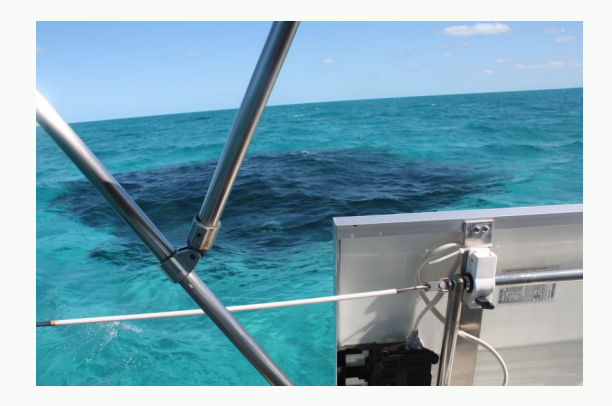
During this 4nm stretch; one must PAY ATTENTION.