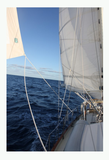
Departed RI for Highborne Cay. Forecast sunny day w/wind 12-14,g18 on the beam- yea!