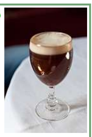
jules / stone soup

2 parts Irish Whisky 4 parts hot coffee 1.5 parts fresh cream 1 tsp brown sugar Heat the coffee, whisky and sugar; do not boil. Pour into class and top with cream; serve hot.