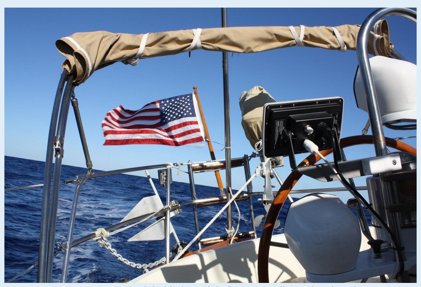
"A look behind on LOON"