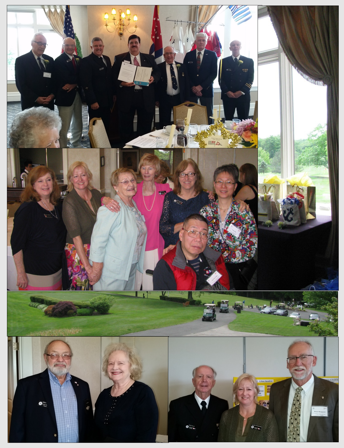
More photos online at www.nvsps.org