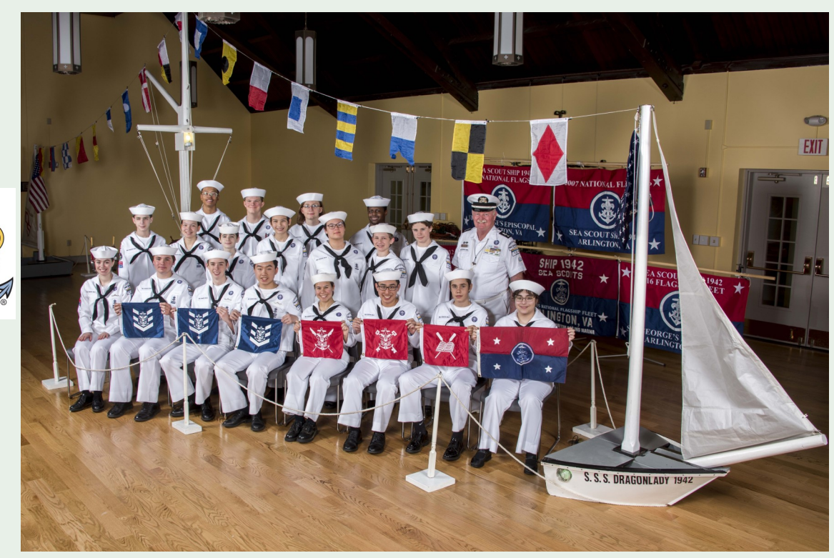
SSS Dragonlady Ship 1942 was recognized as part of the 2017 National Flagship Fleet