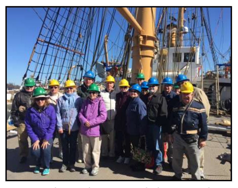
US Coast Guard Barque Eagle Tour, At USCG Yard, Baltimore, MD—April 8, 2017 Thanks to the USCG Barque Eagle Crew for a very thorough tour of all 295 feet. We'll never forget it. 2017 Schedule: <a href="http://www.cga.edu/eagle.aspx?id=690">http://www.cga.edu/eagle.aspx?id=690</a>, Coming to Alexandria, VA in September