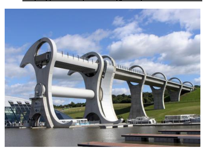
The Falkirk Wheel

If you take your boat to central Scotland, the Falkirk Wheel named after the nearby town of Falkirk, is a rotating boat lift connecting the Forth and Clyde Canal with the Union Canal . It opened in 2002, reconnecting the two canals for the first time since the 1930s. The wheel raises boats by 79 feet, but the Union Canal is still 36 feet higher than the aqueduct which meets the wheel. Boats must also pass through a pair of locks between the top of the wheel and the Union Canal. The Falkirk Wheel is the only rotating boat lift of its kind in the world. If you don't have your boat in Scotland, the site sells tickets to ride the wheel in a boat and go through the upper locks to the Union Canal and back. Cindy and I rode this wheel on our last trip to Scotland in 2004. The following link will give you more information, pictures and a video on the Falkirk Wheel: https://en.wikipedia.org/wiki/Falkirk Wheel