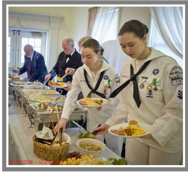
Good food and conversation