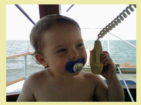
If Andrew can use VHF, so can you!

In NVSPS we encourage you to teach them while they are young, use proper procedures and don't be shy about getting on the VHF radio if necessary. NVSPS and USPS have some excellent courses and videos teaching proper use of the radio.