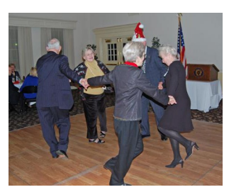
Guests dance the night away.