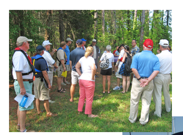
Skippers and guests assemble to decide on boat assignments.