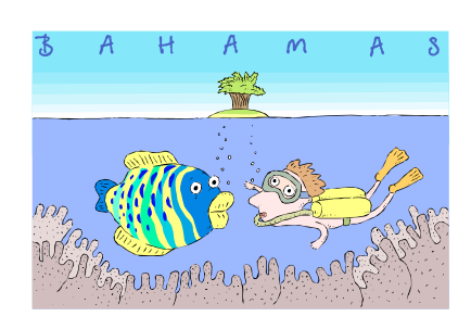
Cruising in the Bahamas Talk 8 September Meeting Don't miss it! See Page 5 for details.