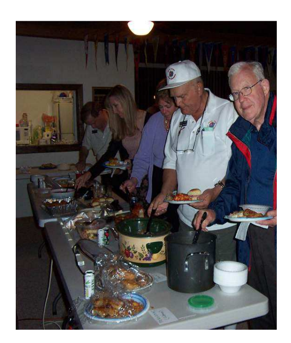
Happy pot-luckers load up at Fairfax Yacht Club

Weatherwise – If we don't have some rain soon, we'll need to have wheels installed on our boats. Keep a weather-eye on the changes that are coming. Also, watch out for those gusty northwesterly winds after a cold front passes the area and high pressure builds.