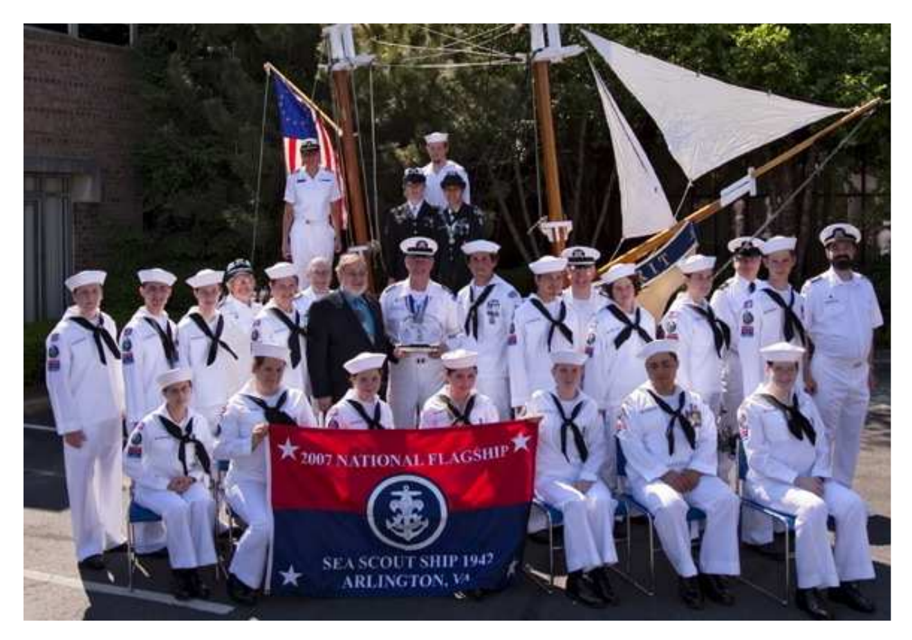
Ship 1942 at BoatUS Headquarters