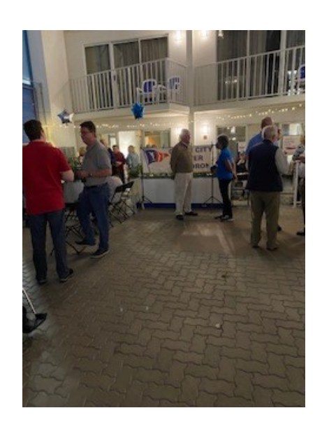
Squadron members socializing at the hospitality suites