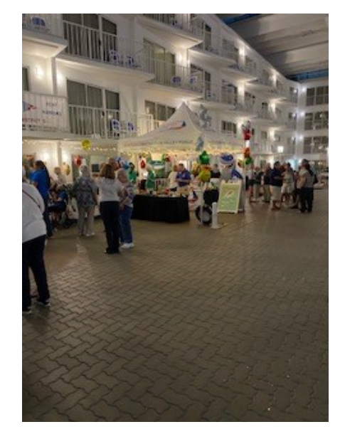
Squadron members visiting the hospitality suites